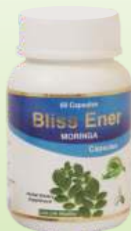
BLISS ENER MORINGA CAPSULES