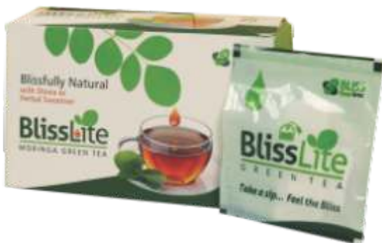
BLISS LITE MORINGA GREEN TEA 25 Pack