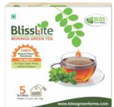
BLISS LITE MORINGA GREEN TEA 5 Pack