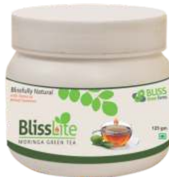
BLISS LITE MORINGA GREEN TEA POWDER