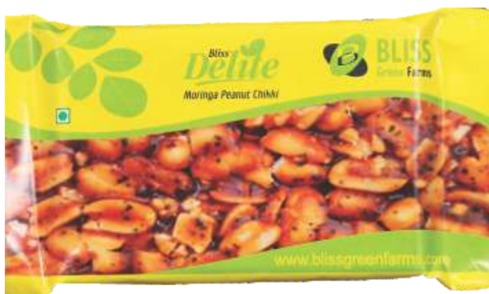
Bliss Delite Moringa Peanut Chikki