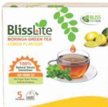
BLISS LITE MORINGA GREEN TEA LEMON