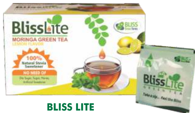
BLISS LITE MORINGA GREEN TEA LEMON