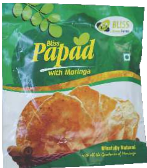
Bliss Moringa Papad

BLISS GREEN FARMS Introduces Moringa Leaf based Food Products for easy consumption in daily diet. These food products are supplemented with recommended dosage of Moringa to promote healthy life.