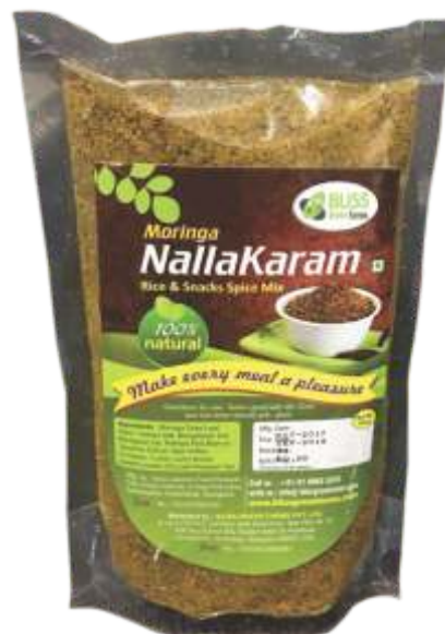
Bliss Moringa Nallakaram