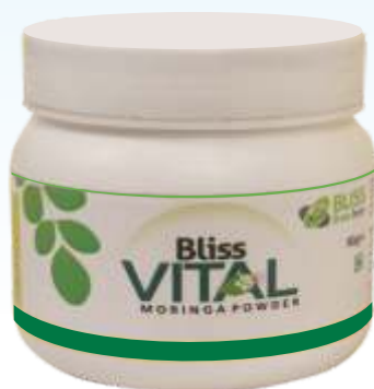
BLISS VITAL MORINGA POWDER

BGF introduces “ Nutraceutical Products ” which will help us to get the right amounts of all the right nutrients to feel your best everyday.